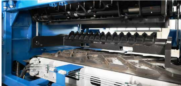
Definition of the final grain size via various after breaker bars and screen baskets

Thanks to their synchronously or asynchronously adjustable shafts, the FORUS shine particularly well with bulky, brittle and ball-shaped materials. The shafts are self-cleaning, which also reduces the risk of winding. In addition, the quickly exchangeable secondary crushing bars allow precise size determination of the end product. Their compact dimensions make them particularly space-saving and easy to transport. Thanks to their sophisticated overall system – consisting of an efficient drive train and a slow-running crushing unit – they are very low in emissions.