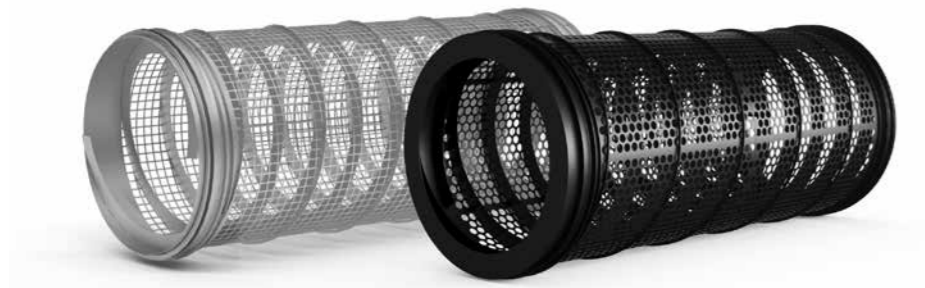
Extra large trommel with at least 10 % more screening surface compared to the competitor trommels

In addition to the high throughput capacity and cost-effectiveness of our TERRA SELECT , a major advantage lies in the screening trommels themselves. These can be easily exchanged on our machines and thus adapted to the desired application. Solid, punched steel trommels prove to be particularly robust, even in difficult applications such as pre-shredded construction waste. On the other hand, finer segmented versions with all types of wire mesh produce the most precise results with light materials such as green waste or compost. This allows you to customise your TERRA SELECT precisely to your material.