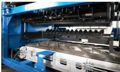
After breaker bars replaceable within 10 minutes (also F 38)