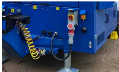
Available as a hybrid machine or as a fully electric version