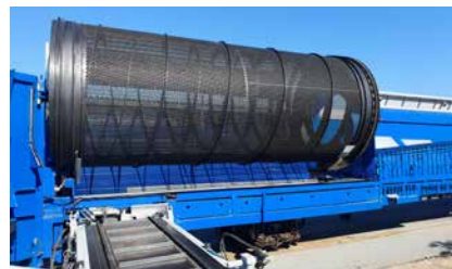
Quick and easy changing of the screening trommel