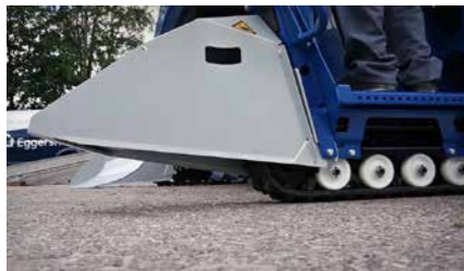
Adjustable track clearers

The BACKHUS A 30 has all the advantages of a self-propelled machine and thus enables the space-saving foot-to-foot placement of the windrows. It therefore does not require a tractor or an external drive. On top of that, the extremely easy-to-handle machine can also be placed very simply on a trailer, which makes it ideal for cooperatives and contractors in inter-site use.