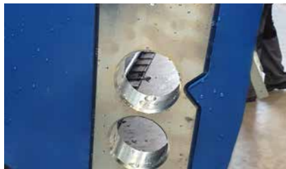
Adjustable cutting gap for final grain size (also Z 50)