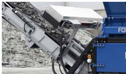
Hydraulically adjustable magnet (also F 38)