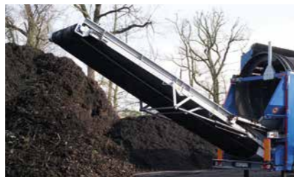
Extended coarse grain conveyor, discharge height up to 3,800 mm