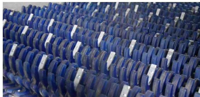
Star screen deck version in durable PU-material (optional)