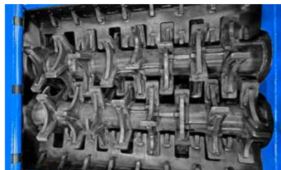
Individually adjustable shaft speeds (also F 25)