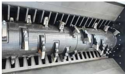
Long-life marathon rotor (also Z 60)