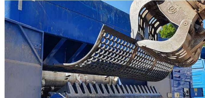
Definition of the final grain via screen baskets and cutting gap

With their higher motor power, the TEUTON reliably shred even robust and resistant material. A selection of different rotor tools, cutting gap settings and screen baskets enables exceptionally precise definition of the final grain. They are a particularly safe choice as the slow-running rotor automatically reverses in the event of disruptive materials. Low wear and fuel consumption as well as easy maintenance also characterise the TEUTON .