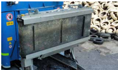
Powerful neodymium magnet with discharge on both sides (also Z 60)