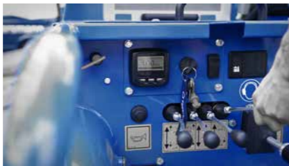
Intuitive operation through manual control