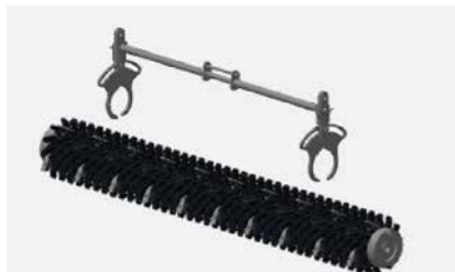
Eggersmann Quickchange system for the screen shafts