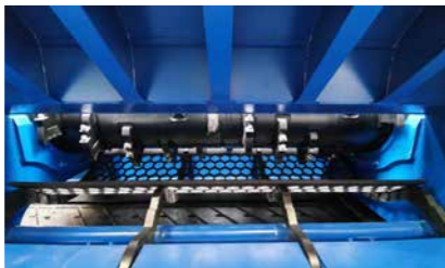
Insensitive to disruptive material due to reversing rotor (also Z 50)